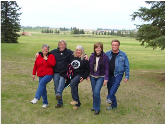
The Captain Morgan bunch