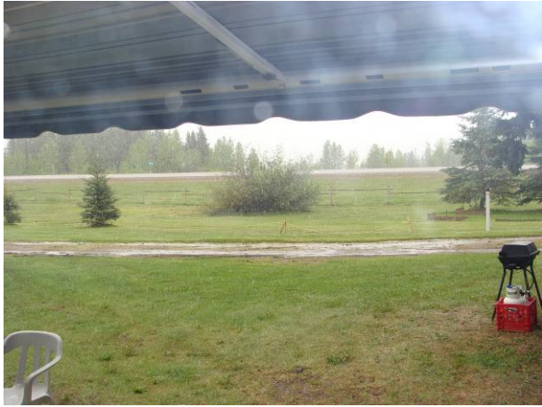
Snow on the Barbie....