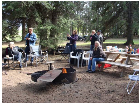
Hey did somebody get a message?