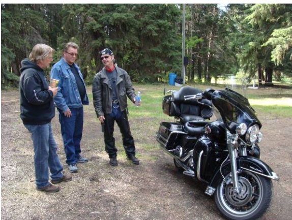
Well at least one Bike made it.